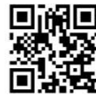
X / Twitter